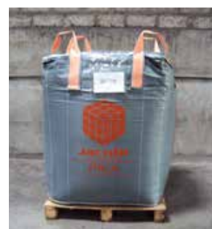
Polypropylene liner-free FIBCs (super sacks), two bags per pallet