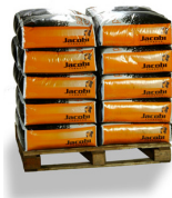
Polyethylene valve bags of 25 kg (55 lb) net weight on 500 kg (1100 lb) pallets

Tel: +41 52 647 30 00 Fax: +41 52 647 30 09 infoch@jacobi.net